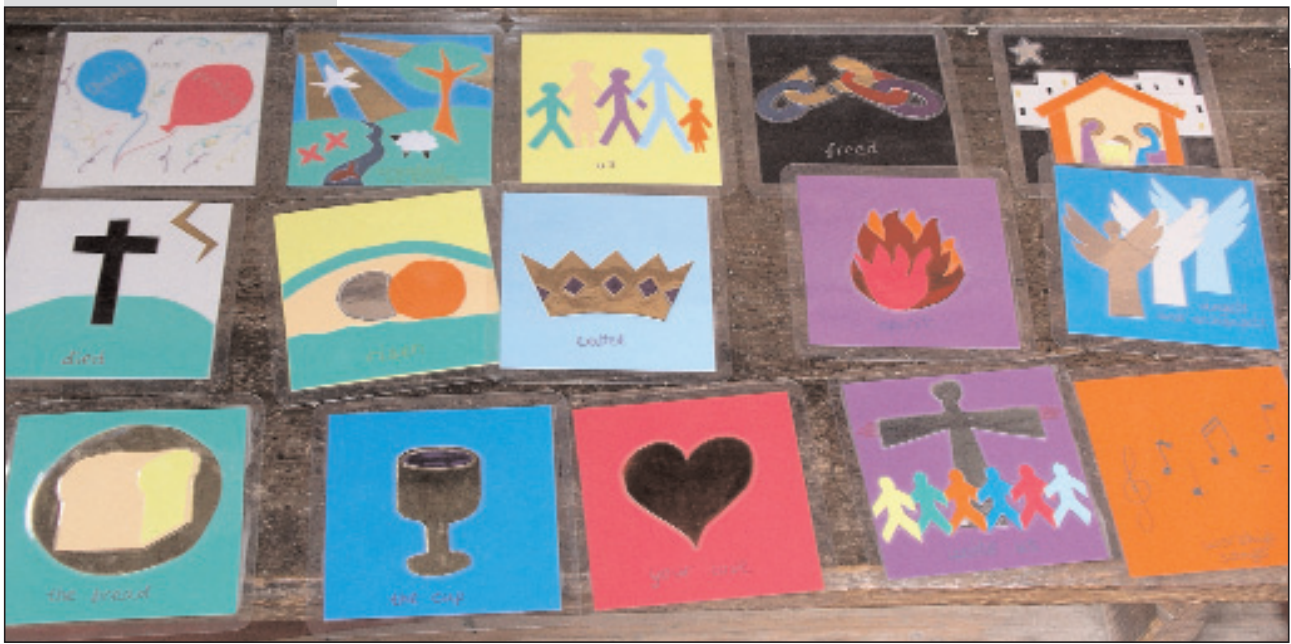
Stained glass fuzzy felt