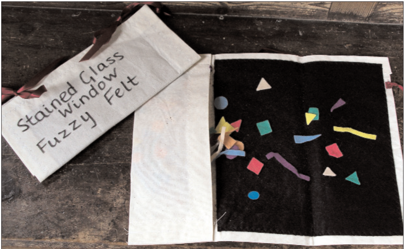
Stained glass fuzzy felt